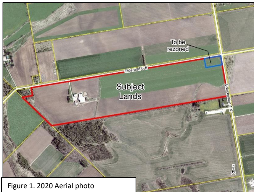
Figure 1. 2020 Aerial photo

The purpose of the amendment is to rezone a portion of the subject lands (approx. 0.8 ha) from Agriculture (A) Zone to Site Specific Agriculture (A-124) Zone to allow the construction of a new parochial school.